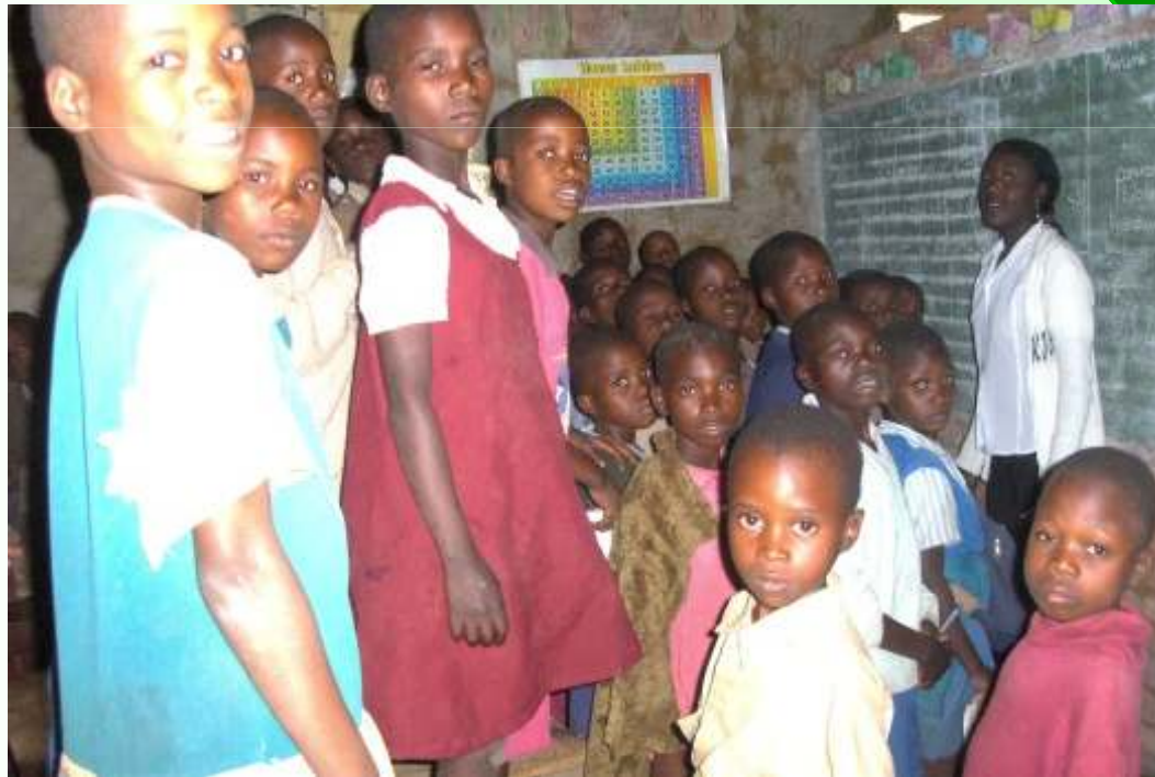
Farm Orphan Support Trust of Zimbabwe