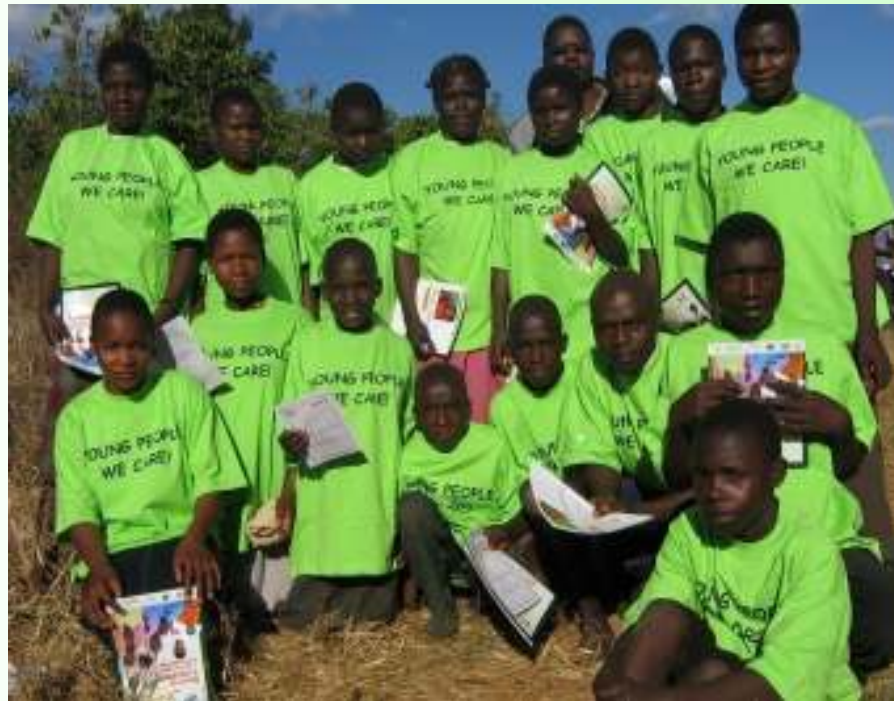
Farm Orphan Support Trust of Zimbabwe