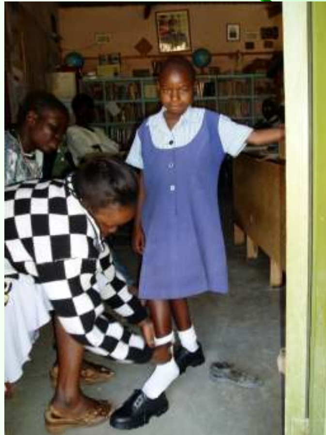
Farm Orphan Support Trust of Zimbabwe