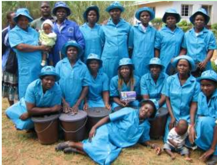
Farm Orphan Support Trust of Zimbabwe