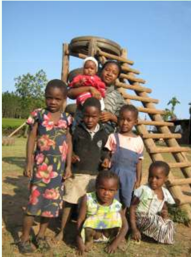
Family Orphan Support Trust of Zimbabwe