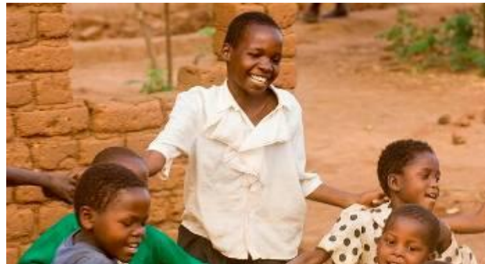
Supporting Children Affected by HIV/AIDS