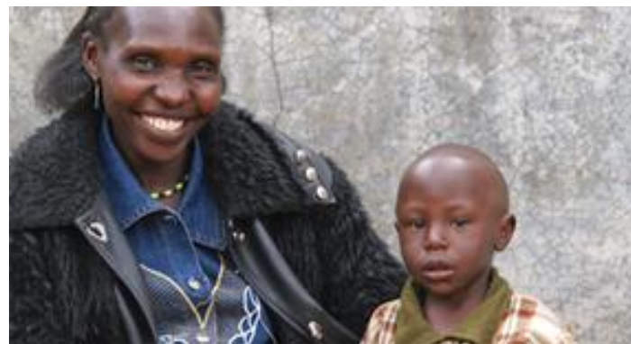
Preventing Mother-to-Child Transmission