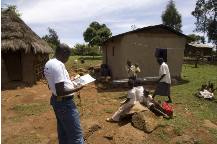
Counselors use smart phones to track and follow-up with patients in remote, rural Kenya