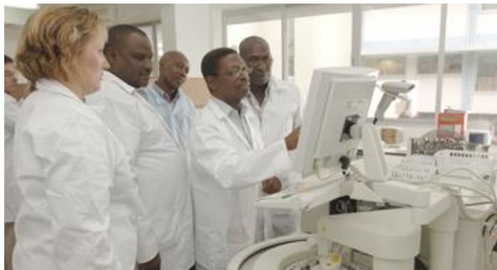
Strengthening Health Systems