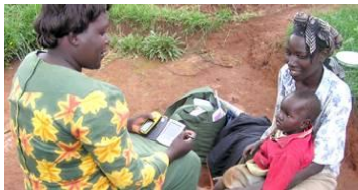
Access to Testing and Treatment