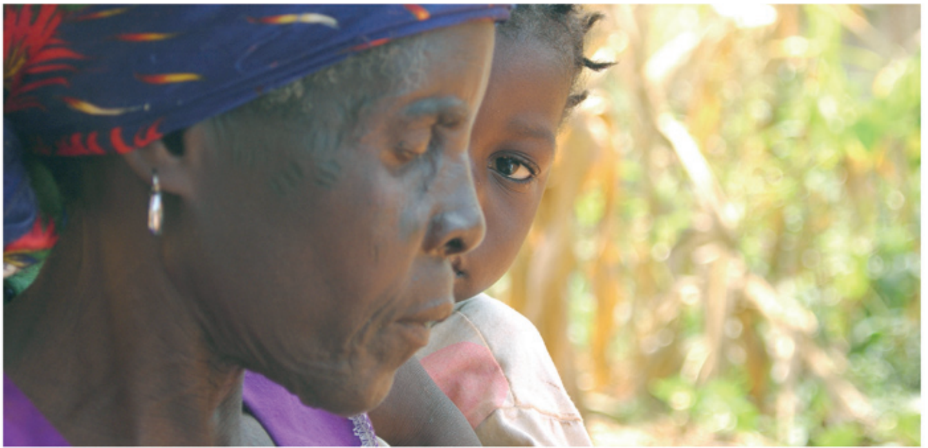
As grandparents lose their adult children to AIDS, they suffer the loss of their support system for old age and find themselves caring for increasing numbers of grandchildren.

The sheer number of orphaned and vulnerable children is overwhelming. Many well-meaning donors are funding orphanages as a solution to the problem. However, institutions are very expensive and can only reach limited numbers of children. Most importantly, orphanages often fail to meet children's developmental needs and do not prepare them for adult life in a community. While institutions can serve as a temporary, last-resort response, they are not a long-term solution.